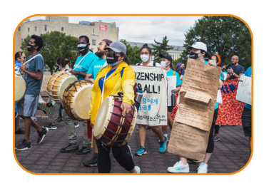
Organizing & Advocacy